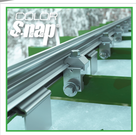
Color Snap© Installation 9/16" Hex Bolts w/Top Block (190 in-lbs max)