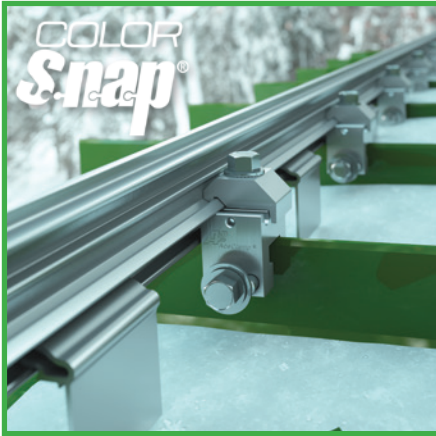
Color Snap® Installation 9/16" Hex Bolts w/Rail Connector (190 in-lbs)