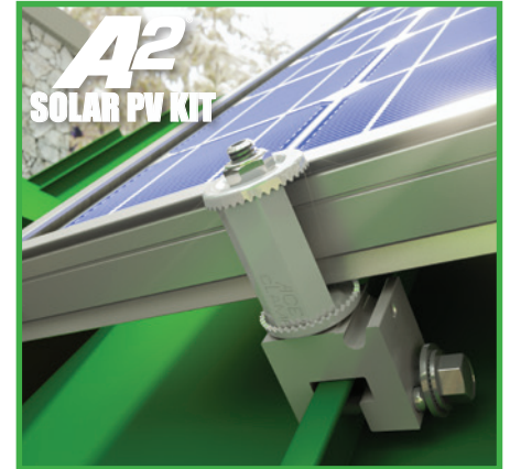
A2 SOLAR PV KIT Solar PV Kit Installation Kit Mounting Post - 3/16" Hex Drive (100 in-lbs) 9/16" Hex Nut securing PV Panel (100 in-lbs) max

Please refer to the below chart for the appropriate torque specs. For other styles or materials not shown here, feel free to contact the Engineers at AceClamp for further assistance.