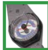
Dial indicator torque wrench