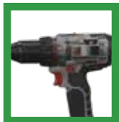
Industrial grade screwgun