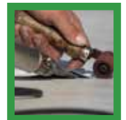
Hand-held heat gun and roller