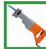
Sawzall to trim excess length of rail