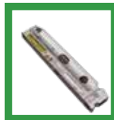
chalk line or laser