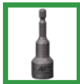
9/16" hex socket & adaptor for screwgun