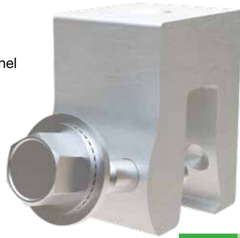
Shown: Part# 5056-N