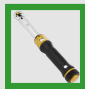
Calibrated torque wrench

Tilt AceClamp® so pins open to fit your roof profile. They come 100 in a box.