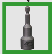
9/16" hex socket