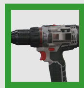
Industrial grade screw gun