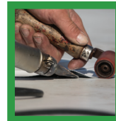
Hand-held heat gun and roller