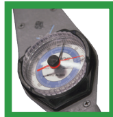
Dial indicator torque wrench