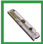
chalk line or laser