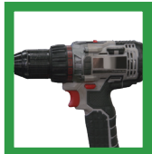
Industrial grade screwgun