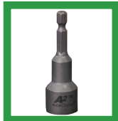
7/16" hex socket & adaptor for screwgun