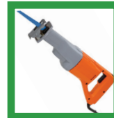
Sawzall to trim excess length of rail