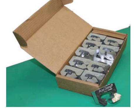
Order your pre-assembled AceClamp<sup>®</sup> ML<sup>®</sup>. They come 100 in a box.

Position the AceClamp<sup>®</sup> ML<sup>®</sup> on the standing seam.